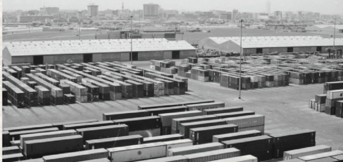
Port Rashid in the 1970s