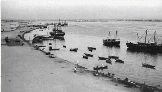
Arrival by sea